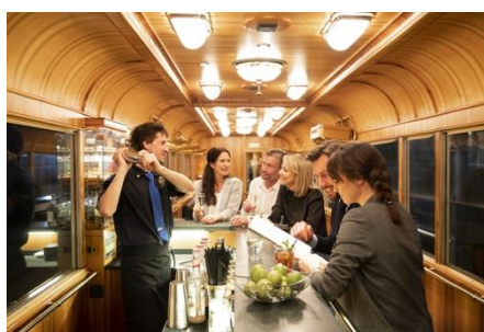
Piano Bar Wagon