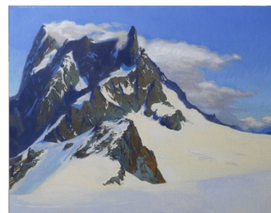
Workshop with a Ghost documentary