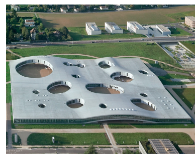
Rolex Learning Center