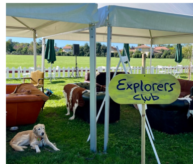
Explorers Tent @ genevapolo.com