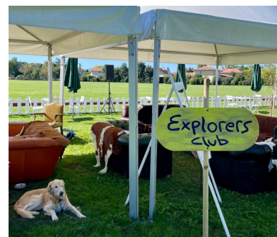
Explorers Tent @ genevapolo.com